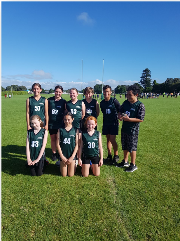
Under 12 'Rima' Touch team