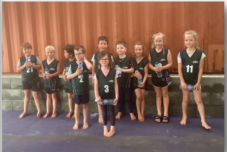
Under 6 'Tahi' Touch team