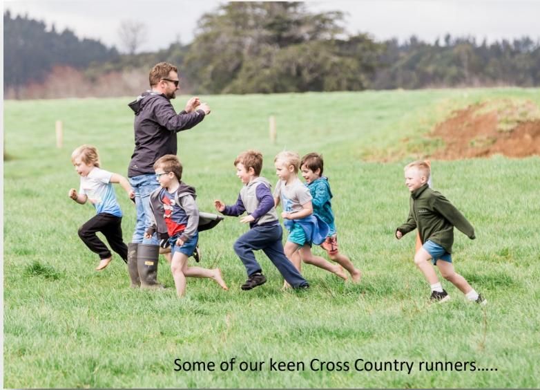
Some of our keen Cross Country runners.....