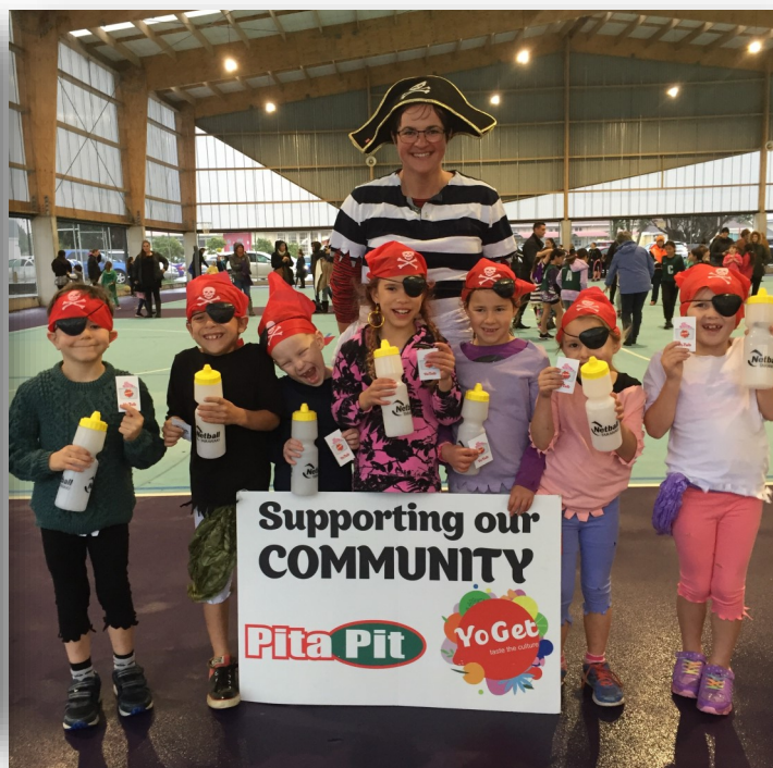
Two of our netball teams at the last 'dress-up' game of the season