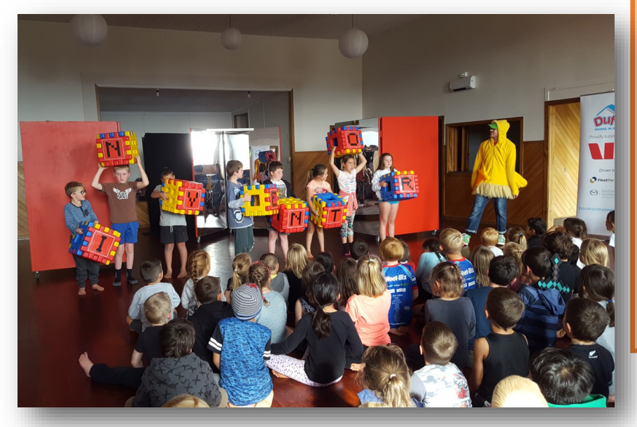
Duffy Theatre last Thursday