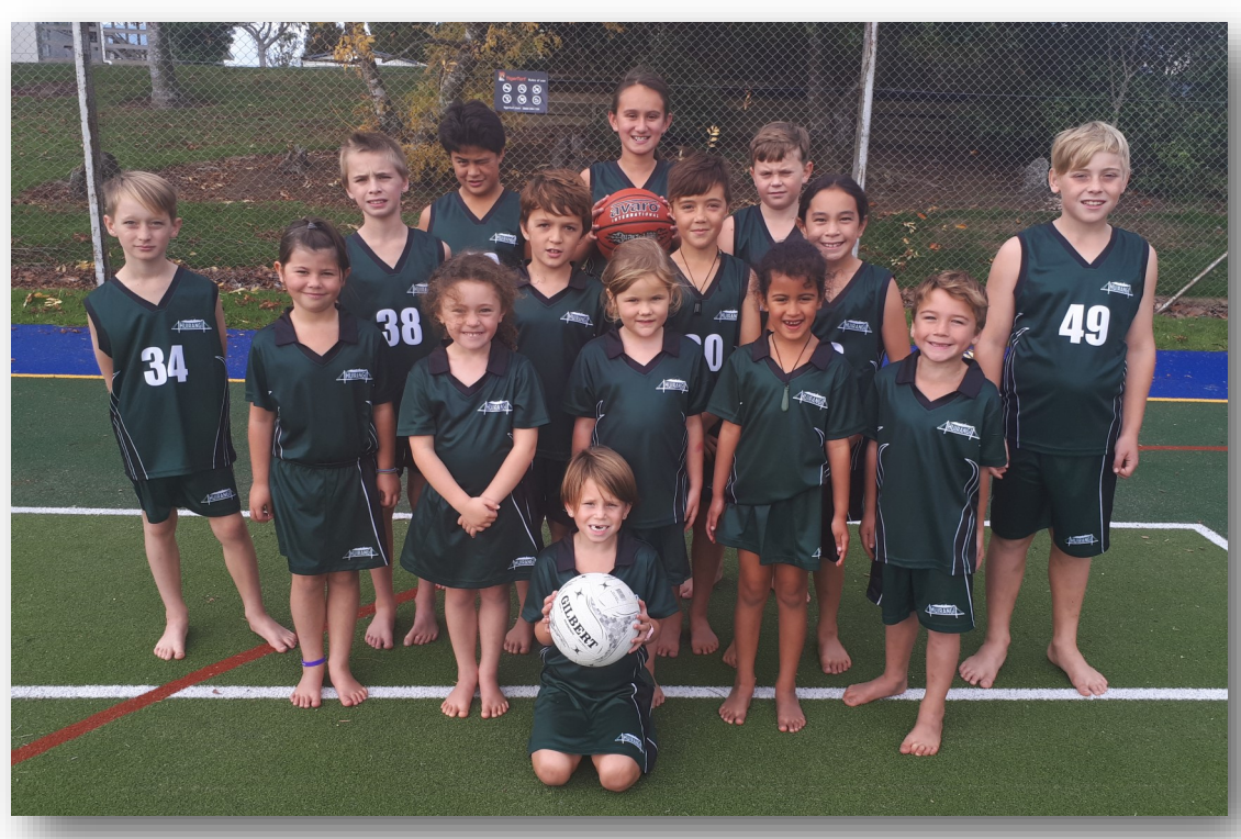
Respectful Accountable Fair Trustworthy