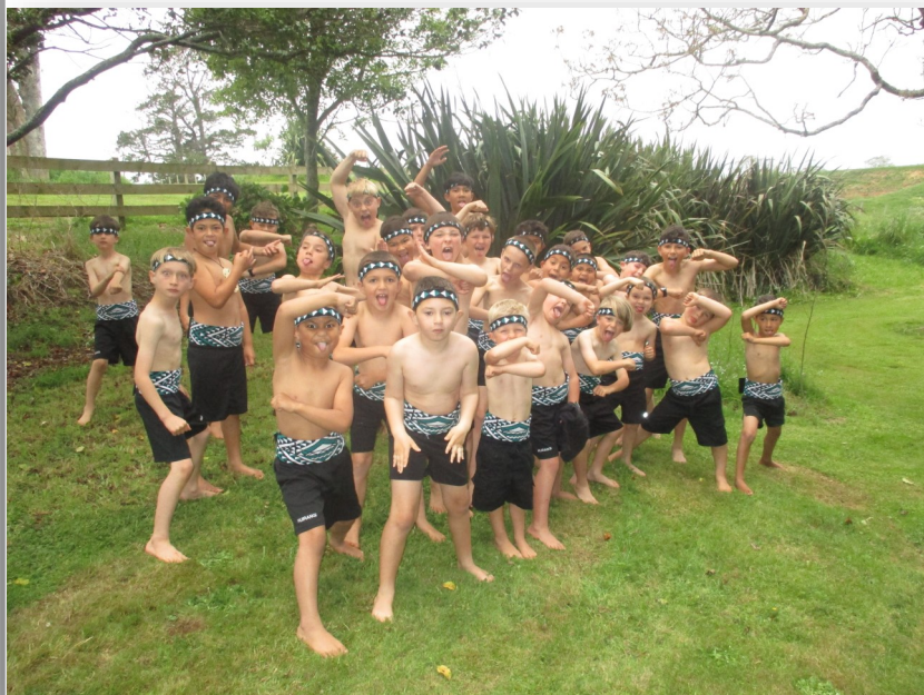
Our fabulous Kapa Haka Boys.....

Huirangi School Hats: Still some at school for sale for $12 each. The hats provide maximum sun protection for faces, ears and back of the neck. These will become compulsory in Term 1 next year, so please contact the school office to purchase one.