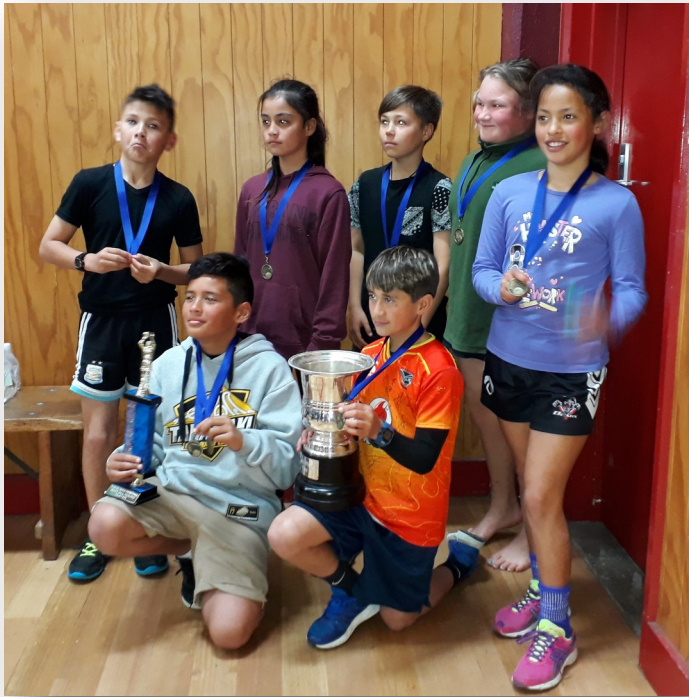
Some of our Sporting Stars! - the basketball team who won the competition