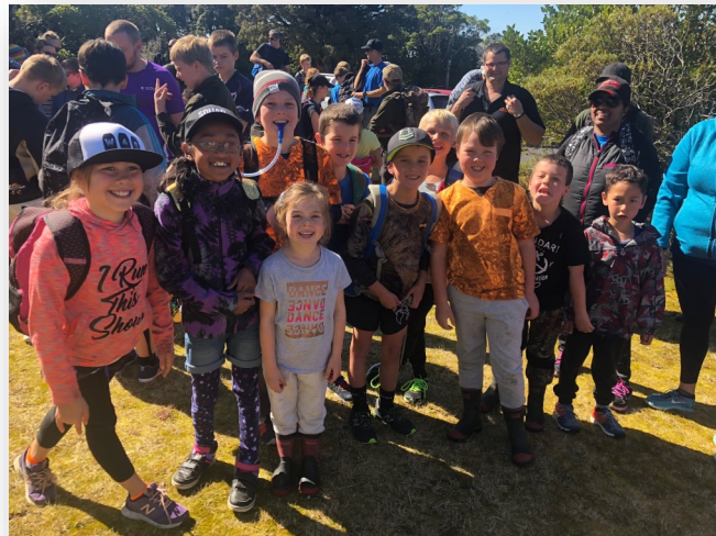
← A big group of our children attended the Adventure Race over the weekend!

Parking will be on Waitara Road, however you may be able to park on the school field if it is dry and firm. Look for the sign and the open gate by the Hall!