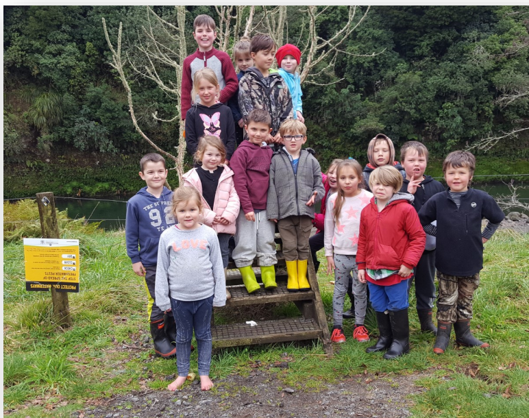
Our Everett Road Scenic Reserve planting crew! Awesome day!

PETS DAY START TIME: Animals to arrive just before 10.30am please. Judging of Chickens and Lambs will commence at 10.30am. Chickens will be in the Hall and lambs on the field.